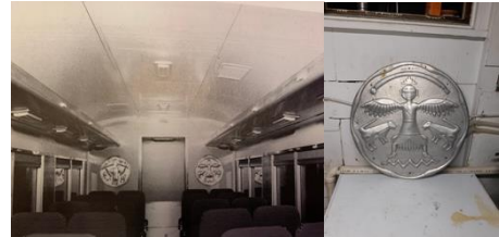
Medallion

The restoration crew is looking for Original Santa Fe coach car medallions. All of our 47xx series cars would originally have had 4 of these in each car. They are looking to find at least 4 so we could have one car with them. If any Museum members have any leads on these please contact me.