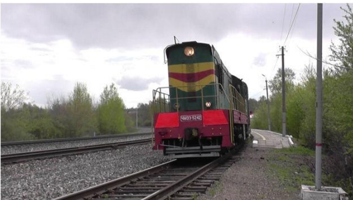
Switcher on exactly this track at my station.

I returned to my office just in time. The switcher with the freight cars for my station was near the station. I prepared a route and turn on permission signal at the entrance. The switcher arrived on the nearest siding. At that time the Engineer from the first train told me that his assistant was soaking wet and that he was trying to carry this older lady up to the station. I gave an order to the switcher to move on out to the track and head to the end of the station to pick them up.