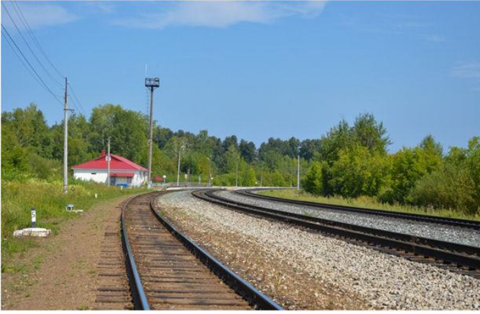
The Zavodskaya station and the station building.

I was working the night shift. It was really dark that night, and the sky was covered by heavy clouds and it was pouring with rain. Usually, in horror movies, all the bad stuff happens in that kind of weather, and at that time of night!