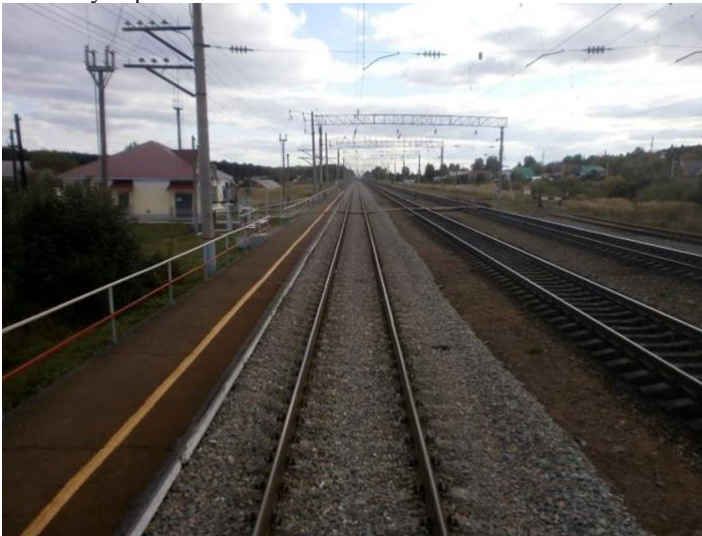
Northern part of Uski station

What is the job of station master? If I write a book about the job it would be a thick book, and even then, some things would be untold. But I will try to explain it briefly. The station master must be the owner, and the host of the station. The station master is responsible for all that happens within the borders of the station, from the entrance signal at the one side of the station (600-800 feet before the first station switch), until the entrance signal from another side, from safety (it is the highest priority of course) to garbage on the station or tracks. The Station master supervises the station operator (s) and all types of major maintenance work at the station.