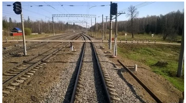
Uski station, station building, platform, tracks

The events described in my past story took place on July 5, 2014. It was a Saturday. At the beginning of the next week my station master had to make a monthly station audit. And I asked him if I could participate in the audit, to start learning the job of a station master. The audit was planned for the next day after my night shift, and after another station operator took over my duty, I went to the station master’s office. For almost the whole day I walked with him and the track maintenance supervisor, the signal maintainer, and the radio network maintainer across the entire station. We checked each turnout, each track, and each rail joint. They describe to me the many parameters and measures that must be checked at each of the turnouts, the possible malfunctions that can occur, and that the station master must check. I felt that my head would crack from an overabundance of information. I thought that I would never be able to get it. After we finished checking the station, we went back to the station master’s office and he then allowed me to enter the information about some malfunctions we had noted in the special computer program – it is the station master’s duty. After spending almost 24 hours at the station, I went home. I wanted to advance, and I wanted to learn the station master’s job and make the next career step.