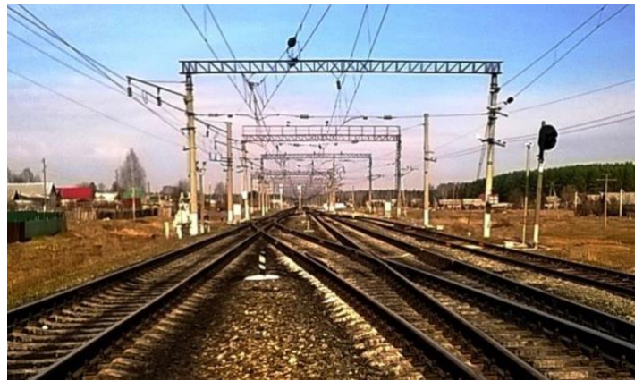
Southern part of Uski station

What is the job of station master? If I write a book about the job it would be a thick book, and even then, some things would be untold. But I will try to explain it briefly. The station master must be the owner, and the host of the station. The station master is responsible for all that happens within the borders of the station, from the entrance signal at the one side of the station (600-800 feet before the first station switch), until the entrance signal from another side, from safety (it is the highest priority of course) to garbage on the station or tracks. The Station master supervises the station operator (s) and all types of major maintenance work at the station.